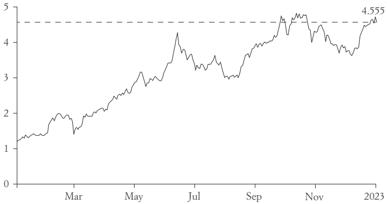
FIGURE 2. Italy Government Bond yield, 10 years.